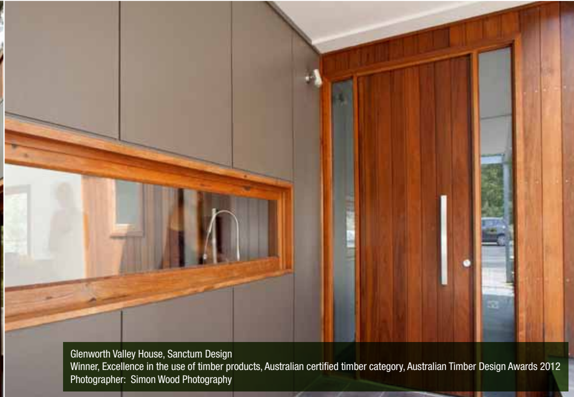
Glenworth Valley House, Sanctum Design Winner, Excellence in the use of timber products, Australian certified timber category, Australian Timber Design Awards 2012